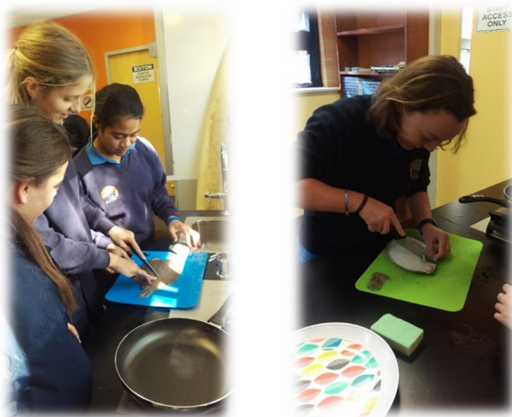
Marine Studies practising fish filleting.

Marine Studies classes are completing their cooking activities. They have learned how to fillet fish and prepare shellfish for cooking. As the weather improves, the students are looking forward to beginning their snorkelling unit in Term 4.