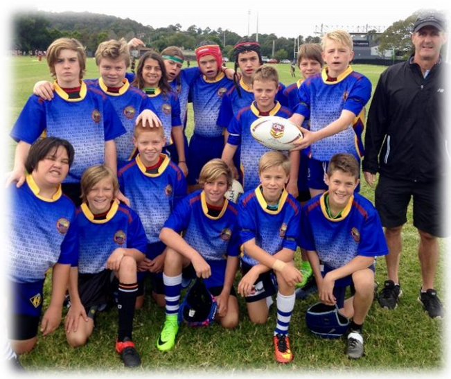
Under 14 Boys League Team